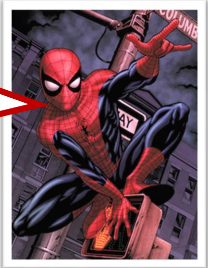
Spiderman superhero, college student

With great power there must also come great responsibility.