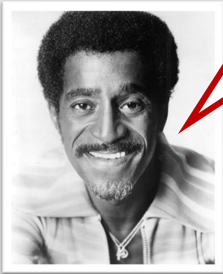
Sammy Davis Junior singer

You always have two choices: your commitment versus your fear.