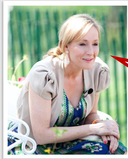
J.K. Rowling author, screenwriter, film and TV producer

It is our choices ... that show what we truly are, far more than our abilities.