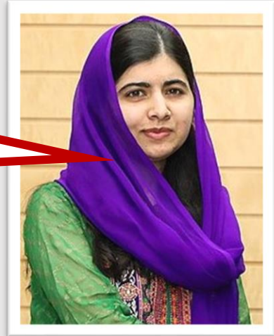
Malala Yousafzai Pakistani activist

My father always said, 'Malala will be free as a bird'.