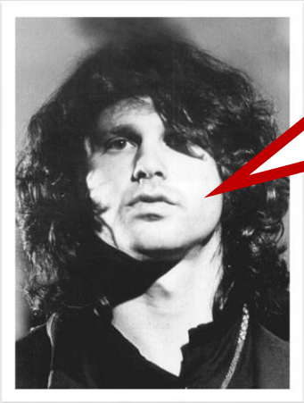
Jim Morrison singer, songwriter, poet

A friend is someone who gives you the total freedom to be yourself.