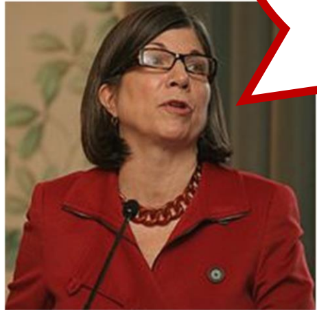
Anna Quindlen journalist, New York Times

Life is not so much about beginnings and endings as it is about going on and on and on. It is about muddling through the middle.