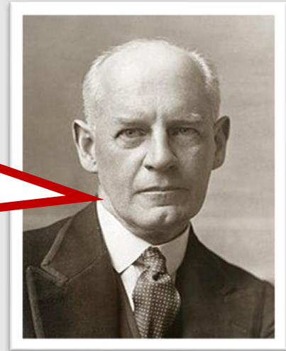
John Galsworthy novelist

The beginnings and endings of all human undertakings are untidy.