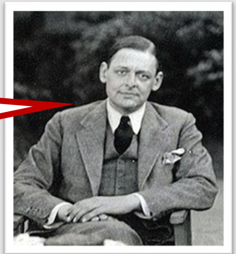
T.S. Eliot poet

In my beginning is my end ... in my end is my beginning.