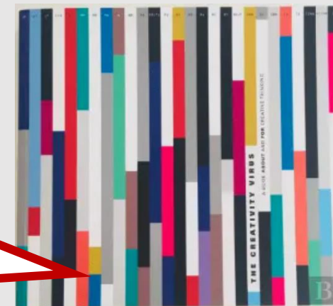
Sandra Barão Nobre in The Creativity Virus by Katja Tschimmel