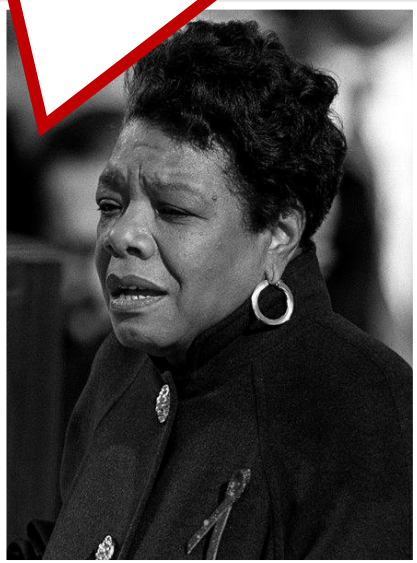
Maya Angelou poet and activist

I dreamt we walked together along the shore. We made satisfying small talk and laughed. This morning I found sand in my shoe and a seashell in my pocket. Was I only dreaming?