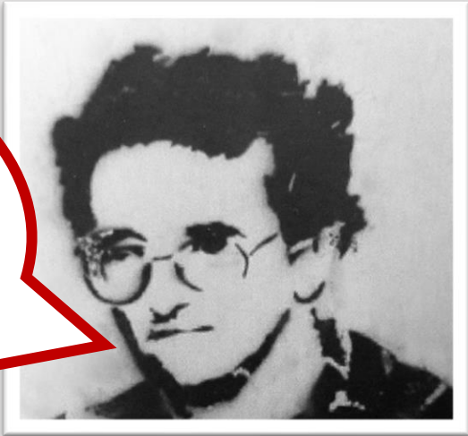
Roberto Bolaño author, in the the novel 2666

Reading is like thinking, like praying, like talking to a friend, like expressing your ideas, like listening to other people's ideas, like listening to music (oh yes), like looking at the view, like taking a walk on the beach.