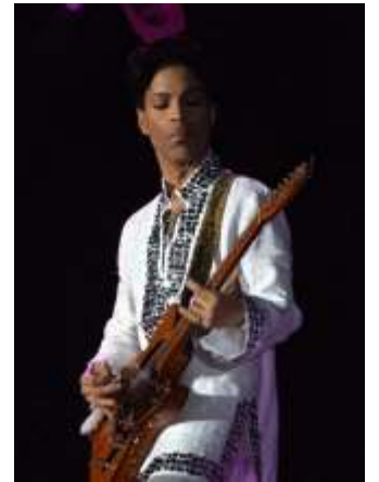
Prince – singer/songwriter