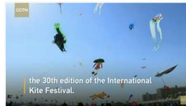
International Kite Festival