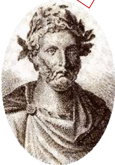
Plautus – Roman playwright 254-184 BCE

Let us celebrate the occasion with wine and sweet words.