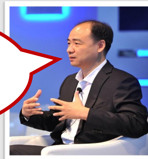
Ma Jun environmentalist

The environmental challenge is so big that no single agency can handle it. It needs collaboration among all the stakeholders – companies, governments, NGOs and the public.