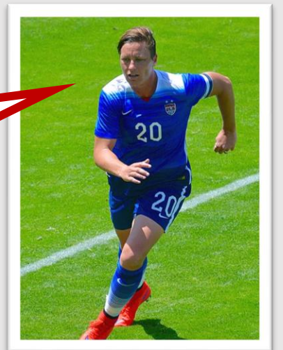
Abby Wambach Women's World Cup winner

I have never once dribbled the whole field and scored a goal by myself.