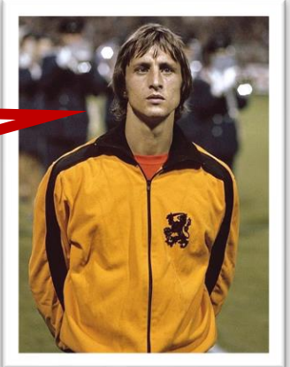
Johan Cruyff Dutch footballer and coach, Ballon d'Or winner

Football has to be fun for kids, or it doesn't make sense.